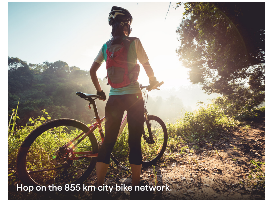
Hop on the 855 km city bike network.

Brook Park; it joins up with trails like the Meadoway. Cycle west downtown and all the way east to hiking and canoeing at breathtaking Rouge National Urban Park. Like all Insoho communities, Inspire is located in an area that gives you a lot of choices. Because we know that getting to and from home matters in so many ways.