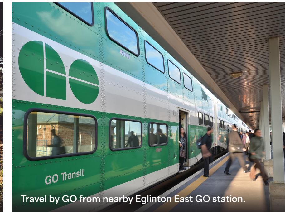
Travel by GO from nearby Eglinton East GO station.