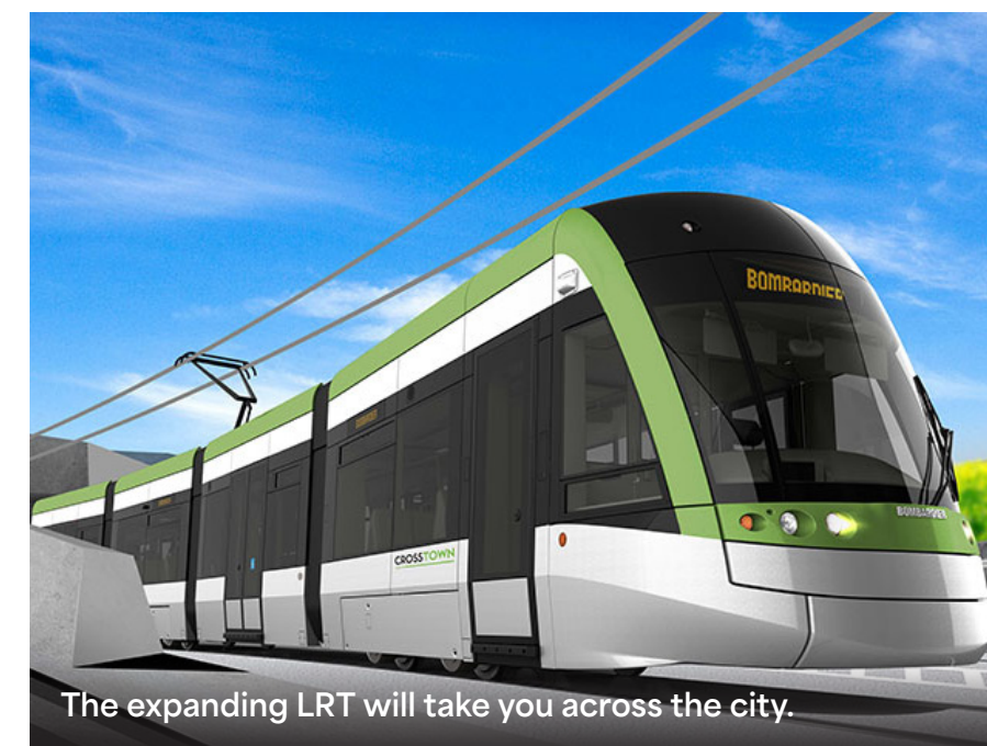
The expanding LRT will take you across the city.